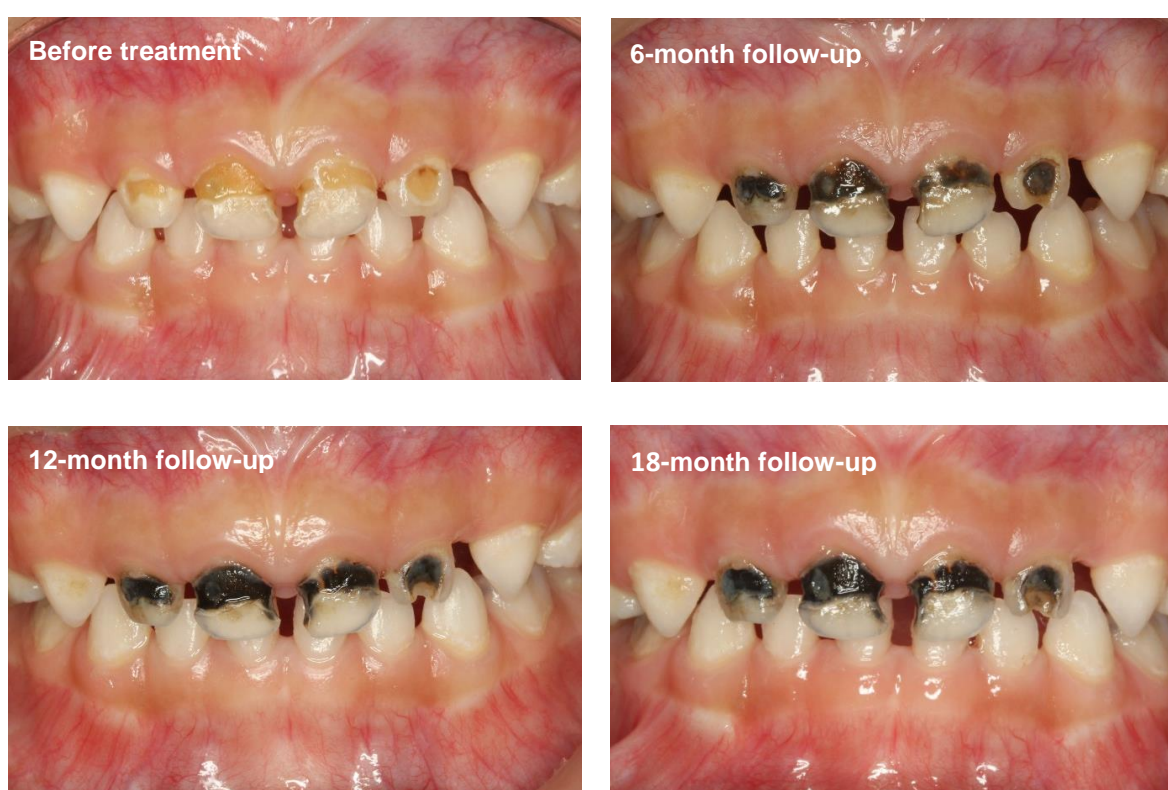
Figure 2. Dental caries before and after the application of 25% silver nitrate solution followed by 5% sodium fluoride varnish.

A double-blind randomised clinical trial was performed to compare the caries-arresting effect of the silver nitrate solution followed by sodium fluoride varnish protocol with that of silver diamine fluoride (SDF) [32]. More than 1,000 kindergarten children aged 3–4 years with cavitated carious lesions were treated with the protocol or SDF (positive control) every six months. The 12-month results found no difference in caries-arresting effects between using the silver nitrate solution followed by sodium fluoride varnish protocol and using SDF [33]. Arrested carious lesions were stained black (Figure 2). No other significant side effect was observed. The study also found that the caries-arresting rate was influenced by the child's oral hygiene and the location of the carious surface.